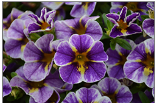
Superbells Holy Smokes! Calibrachoa flowers

Superbells Holy Smokes! Calibrachoa is a dense herbaceous annual with a trailing habit of growth, eventually spilling over the edges of hanging baskets and containers. Its medium texture blends into the garden, but can always be balanced by a couple of finer or coarser plants for an effective composition.