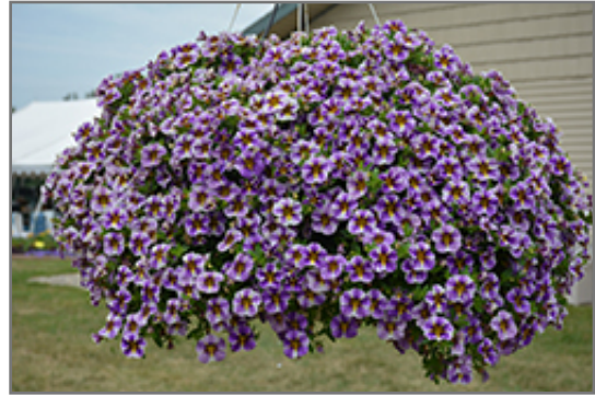
Superbells Holy Smokes! Calibrachoa in bloom