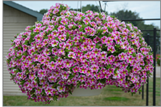
Superbells Holy Cow! Calibrachoa in bloom