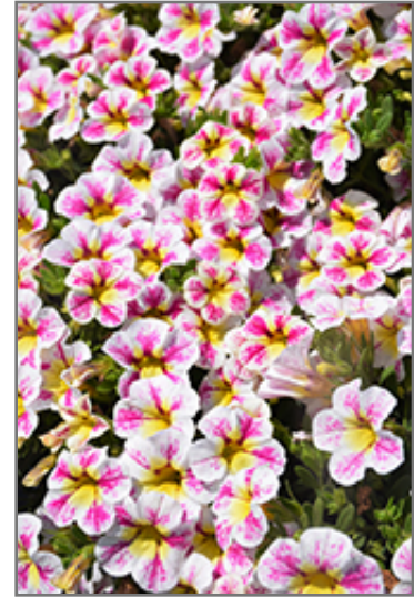
Superbells Holy Cow! Calibrachoa flowers

Superbells Holy Cow! Calibrachoa is a dense herbaceous annual with a trailing habit of growth, eventually spilling over the edges of hanging baskets and containers. Its medium texture blends into the garden, but can always be balanced by a couple of finer or coarser plants for an effective composition.