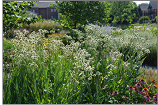
Rattlesnake Master in bloom

Rattlesnake Master is a fine choice for the garden, but it is also a good selection for planting in outdoor pots and containers. Because of its height, it is often used as a 'thriller' in the 'spiller-thriller-filler' container combination; plant it near the center of the pot, surrounded by smaller plants and those that spill over the edges. It is even sizeable enough that it can be grown alone in a suitable container. Note that when growing plants in outdoor containers and baskets, they may require more frequent waterings than they would in the yard or garden.