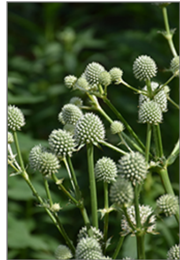
Rattlesnake Master flowers

This plant will require occasional maintenance and upkeep, and is best cleaned up in early spring before it resumes active growth for the season. It is a good choice for attracting bees and butterflies to your yard, but is not particularly attractive to deer who tend to leave it alone in favor of tastier treats. Gardeners should be aware of the following characteristic(s) that may warrant special consideration;