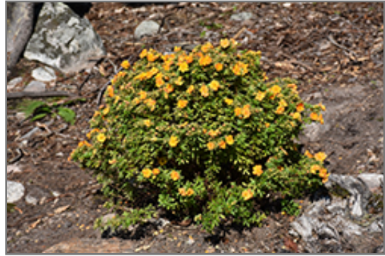
Marmalade Potentilla in bloom

This shrub does best in full sun to partial shade. It is very adaptable to both dry and moist locations, and should do just fine under typical garden conditions. It is considered to be drought-tolerant, and thus makes an ideal choice for a low-water garden or xeriscape application. It is not particular as to soil type or pH. It is highly tolerant of urban pollution and will even thrive in inner city environments. This is a selection of a native North American species.