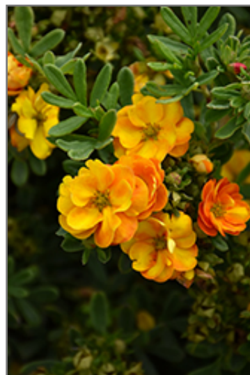
Marmalade Potentilla flowers

Marmalade Potentilla is recommended for the following landscape applications;