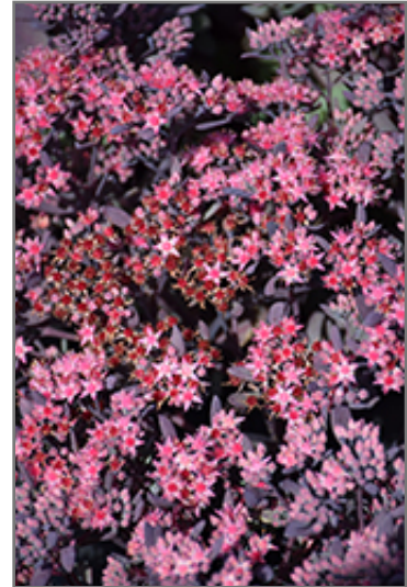
Plum Dazzled Stonecrop flowers

Plum Dazzled Stonecrop is a dense herbaceous perennial with an upright spreading habit of growth. Its medium texture blends into the garden, but can always be balanced by a couple of finer or coarser plants for an effective composition.