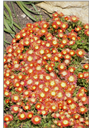
Delmara Red Ice Plant

This is a relatively low maintenance plant, and is best cleaned up in early spring before it resumes active growth for the season. It is a good choice for attracting bees and butterflies to your yard. It has no significant negative characteristics.