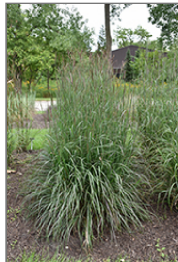
Blackhawks Bluestem in bloom

BRUNSWICK 422 Bath Road Brunswick, ME 04011 1-800-339-8111 207-442-8111