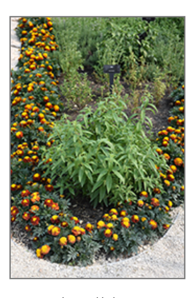
Lemon Verbena

Lemon Verbena will grow to be about 15 feet tall at maturity, with a spread of 15 feet. Although it's not a true annual, this fast-growing plant can be expected to behave as an annual in our climate if left outdoors over the winter, usually needing replacement the following year. As such, gardeners should take into consideration that it will perform differently than it would in its native habitat.