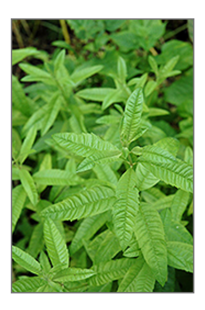
Lemon Verbena foliage

BRUNSWICK 422 Bath Road Brunswick, ME 04011 1-800-339-8111 207-442-8111