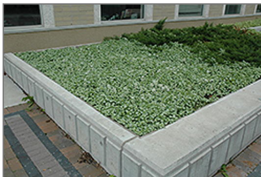
White Nancy Spotted Dead Nettle in bloom