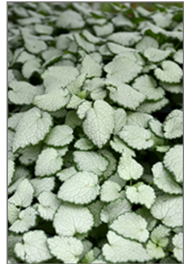
Red Nancy Spotted Dead Nettle foliage

Red Nancy Spotted Dead Nettle is a fine choice for the garden, but it is also a good selection for planting in outdoor pots and containers. Because of its spreading habit of growth, it is ideally suited for use as a 'spiller' in the 'spiller-thriller-filler' container combination; plant it near the edges where it can spill gracefully over the pot. Note that when growing plants in outdoor containers and baskets, they may require more frequent waterings than they would in the yard or garden.