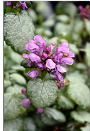
Red Nancy Spotted Dead Nettle flowers