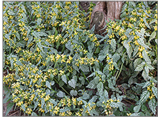
Hermann's Pride Yellow Archangel in bloom

This plant does best in partial shade to shade. It is an amazingly adaptable plant, tolerating both dry conditions and even some standing water. It is considered to be drought-tolerant, and thus makes an ideal choice for a low-water garden or xeriscape application. It is not particular as to soil type or pH. It is highly tolerant of urban pollution and will even thrive in inner city environments. This is a selected variety of a species not originally from North America. It can be propagated by division; however, as a cultivated variety, be aware that it may be subject to certain restrictions or prohibitions on propagation.