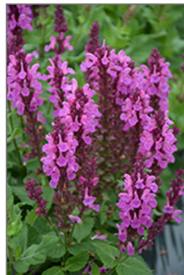
Rose Marvel Meadow Sage flowers

201 Gray Rd (Route 100) Cumberland, ME 04021 1-800-348-8498 207-829-5619