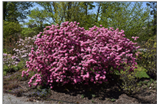
Weston's Aglo Rhododendron in bloom

BRUNSWICK 422 Bath Road Brunswick, ME 04011 1-800-339-8111 207-442-8111