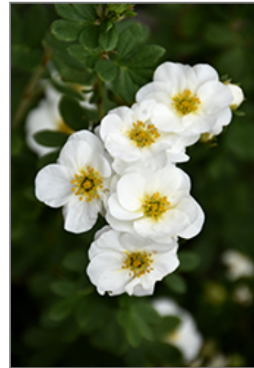
Creme Brulee Potentilla flowers