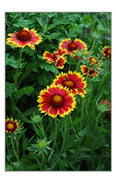
Goblin Blanket Flower flowers

Tomato-red daisy like flowers with golden yellow edges stand above mounds of gray-green foliage on these compact plants; excellent for borders, beds, containers and cutting gardens; drought and heat tolerant requiring little maintenance