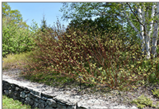
Bailey's Red Twig Dogwood in spring