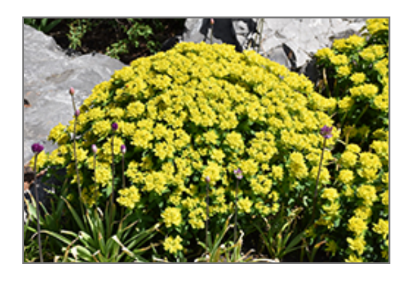
Cushion Spurge in bloom

This is a relatively low maintenance plant, and should only be pruned after flowering to avoid removing any of the current season's flowers. Deer don't particularly care for this plant and will usually leave it alone in favor of tastier treats. Gardeners should be aware of the following characteristic(s) that may warrant special consideration;