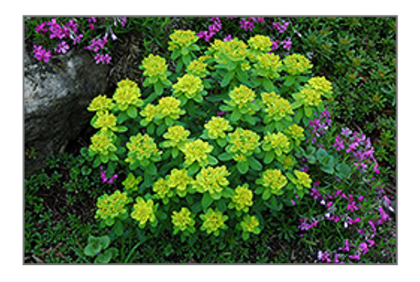
Cushion Spurge in bloom

Cushion Spurge is an herbaceous perennial with a mounded form. Its medium texture blends into the garden, but can always be balanced by a couple of finer or coarser plants for an effective composition.