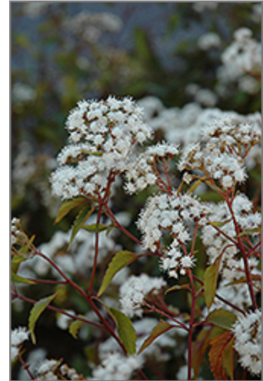
Chocolate Boneset flowers

Chocolate Boneset is recommended for the following landscape applications;