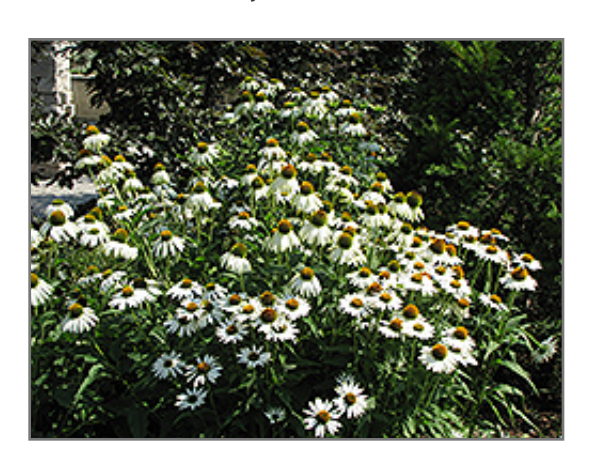
White Swan Coneflower in bloom

This is a relatively low maintenance plant, and is best cleaned up in early spring before it resumes active growth for the season. It is a good choice for attracting butterflies to your yard, but is not particularly attractive to deer who tend to leave it alone in favor of tastier treats. It has no significant negative characteristics.