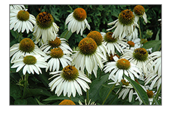
White Swan Coneflower flowers

White Swan Coneflower is an herbaceous perennial with an upright spreading habit of growth. Its medium texture blends into the garden, but can always be balanced by a couple of finer or coarser plants for an effective composition.