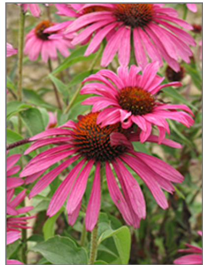
Ruby Star Coneflower flowers

CUMBERLAND 201 Gray Rd (Route 100) Cumberland, ME 04021 1-800-348-8498 207-829-5619