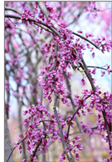
Pink Heartbreaker Redbud flowers

Pink Heartbreaker Redbud is recommended for the following landscape applications;