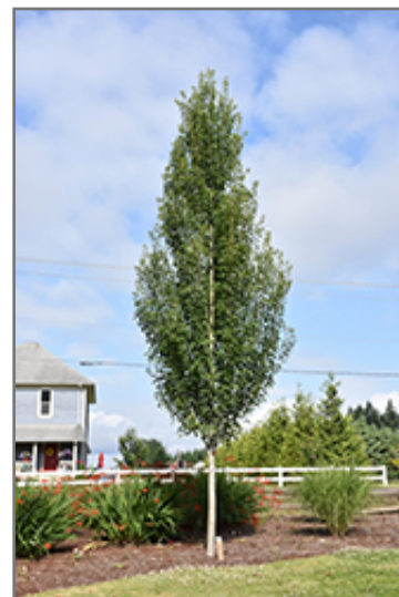
Armstrong Gold Maple