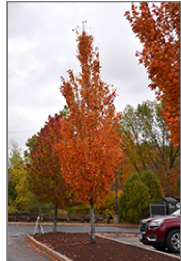
Armstrong Gold Maple in fall

This tree should only be grown in full sunlight. It is quite adaptable, preferring to grow in average to wet conditions, and will even tolerate some standing water. It is not particular as to soil type or pH. It is highly tolerant of urban pollution and will even thrive in inner city environments. This particular variety is an interspecific hybrid.