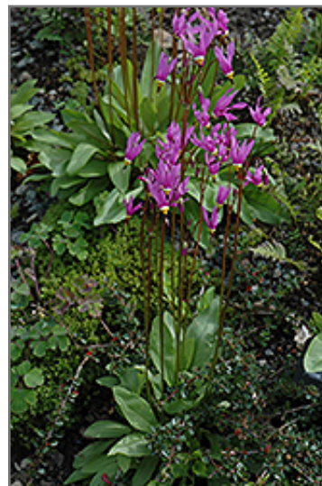
Shooting Star in bloom

BRUNSWICK 422 Bath Road Brunswick, ME 04011 1-800-339-8111 207-442-8111