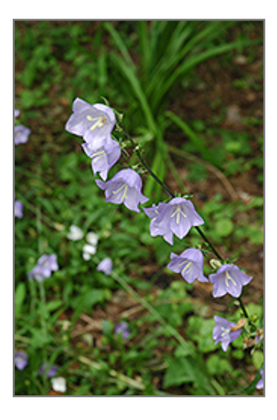
Bluebells Of Scotland flowers

From borders and garden beds to containers, this selection adds a beautiful pop of color during the sunny summer months; nodding, blue bell-shaped flowers rise above bright green foliage; easy to grow, requiring little maintenance