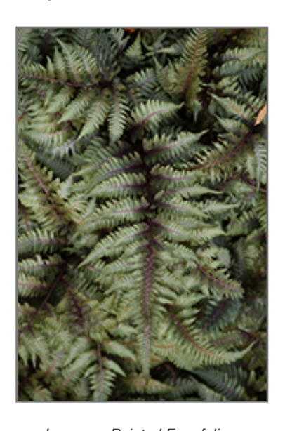
Japanese Painted Fern foliage

Japanese Painted Fern is recommended for the following landscape applications;