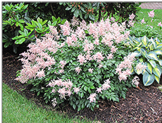
Peach Blossom Astilbe in bloom

BRUNSWICK 422 Bath Road Brunswick, ME 04011 1-800-339-8111 207-442-8111