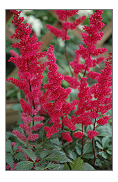
Fanal Astilbe flowers

This early summer bloomer produces tall stems of ruby red plumes that stand out in shaded gardens, borders or containers; vigorous upright habit with low mounding deep green foliage; easy to grow, requiring little to no maintenance; excellent freshly cut