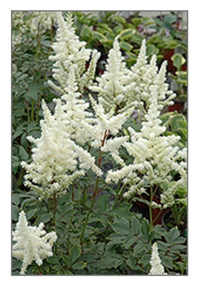
Bridal Veil Astilbe flowers

Bridal Veil Astilbe is an herbaceous perennial with an upright spreading habit of growth. Its relatively fine texture sets it apart from other garden plants with less refined foliage.