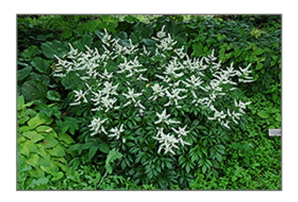
Bridal Veil Astilbe in bloom

This is a relatively low maintenance plant, and is best cleaned up in early spring before it resumes active growth for the season. It is a good choice for attracting butterflies to your yard, but is not particularly attractive to deer who tend to leave it alone in favor of tastier treats. It has no significant negative characteristics.