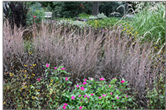
Standing Ovation Bluestem in fall

Standing Ovation Bluestem is recommended for the following landscape applications;