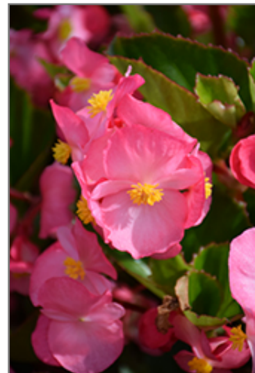
Big Pink Green Leaf Begonia flowers

This is a high maintenance plant that will require regular care and upkeep, and usually looks its best without pruning, although it will tolerate pruning. Deer don't particularly care for this plant and will usually leave it alone in favor of tastier treats. Gardeners should be aware of the following characteristic(s) that may warrant special consideration;