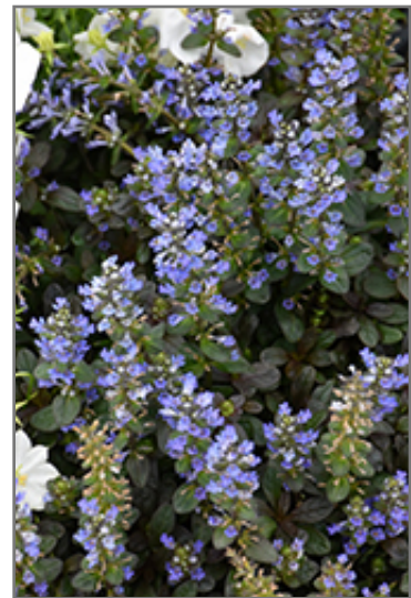
Chocolate Chip Bugleweed flowers

Chocolate Chip Bugleweed is recommended for the following landscape applications;