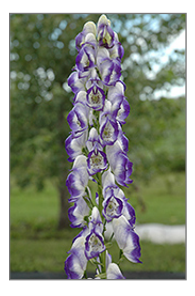
Bicolor Monkshood flowers

A highly toxic, upright perennial that presents hooded white and indigo, bi-colored flowers and dark green ferny foliage; lovely accent for containers and garden beds; prune after flowering; should not be grown around children or in vegetable gardens