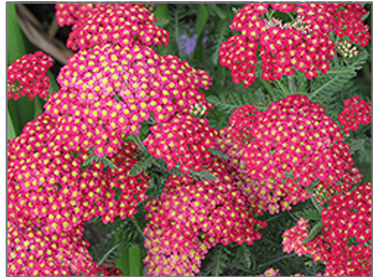
Galaxy Paprika Yarrow flowers

Galaxy Paprika Yarrow is recommended for the following landscape applications;