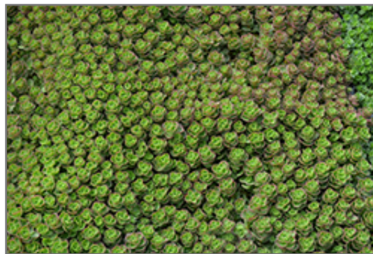
Dragon's Blood Stonecrop foliage

BRUNSWICK 422 Bath Road Brunswick, ME 04011 1-800-339-8111 207-442-8111