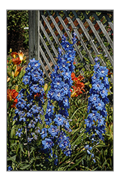
Cobalt Dreams Larkspur flowers

A magnificent display of radiant, cobalt-blue flowers on towering spikes with contrasting white bee; good vertical form, dense flower spikes and strong stems; excellent uniformity is perfect for along borders