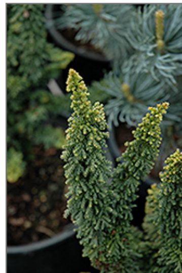
Chirimen Hinoki Falsecypress foliage

BRUNSWICK 422 Bath Road Brunswick, ME 04011 1-800-339-8111 207-442-8111