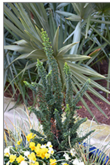
Chirimen Hinoki Falsecypress

Chirimen Hinoki Falsecypress makes a fine choice for the outdoor landscape, but it is also well-suited for use in outdoor pots and containers. With its upright habit of growth, it is best suited for use as a 'thriller' in the 'spiller-thriller-filler' container combination; plant it near the center of the pot, surrounded by smaller plants and those that spill over the edges. Note that when grown in a container, it may not perform exactly as indicated on the tag - this is to be expected. Also note that when growing plants in outdoor containers and baskets, they may require more frequent waterings than they would in the yard or garden.