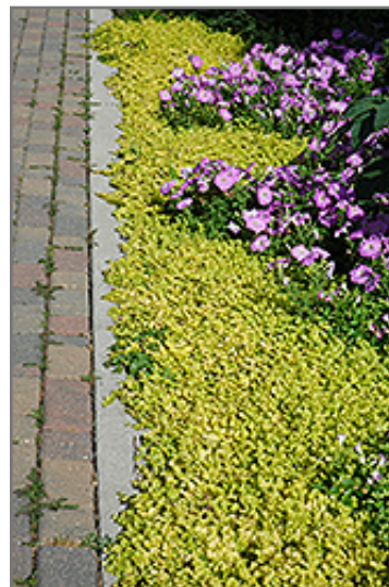
Golden Creeping Jenny

BRUNSWICK 422 Bath Road Brunswick, ME 04011 1-800-339-8111 207-442-8111