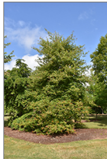
Wildfire Black Gum

BRUNSWICK 422 Bath Road Brunswick, ME 04011 1-800-339-8111 207-442-8111