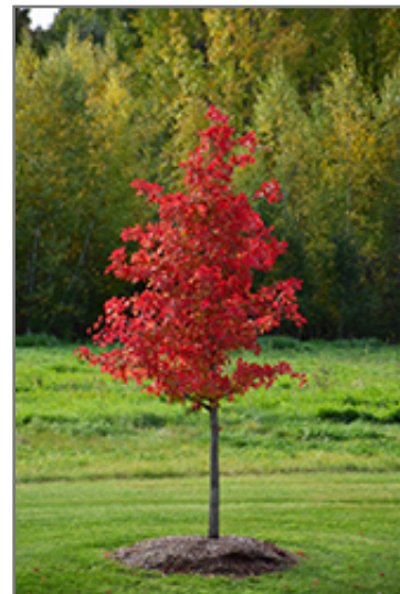
Wildfire Black Gum in fall