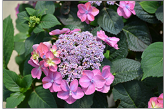
Tuff Stuff Hydrangea flowers

Tuff Stuff Hydrangea makes a fine choice for the outdoor landscape, but it is also well-suited for use in outdoor pots and containers. With its upright habit of growth, it is best suited for use as a 'thriller' in the 'spiller-thriller-filler' container combination; plant it near the center of the pot, surrounded by smaller plants and those that spill over the edges. It is even sizeable enough that it can be grown alone in a suitable container. Note that when grown in a container, it may not perform exactly as indicated on the tag - this is to be expected. Also note that when growing plants in outdoor containers and baskets, they may require more frequent waterings than they would in the yard or garden.