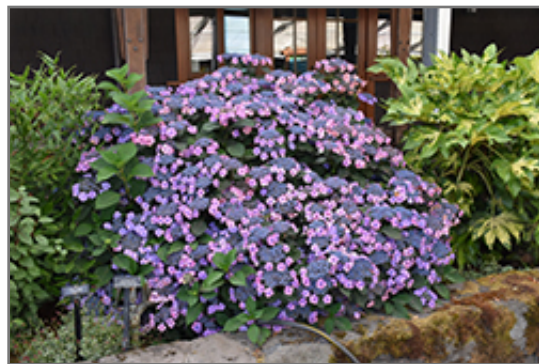
Tuff Stuff Hydrangea in bloom

BRUNSWICK 422 Bath Road Brunswick, ME 04011 1-800-339-8111 207-442-8111