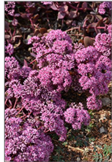
Cherry Tart Stonecrop flowers

Cherry Tart Stonecrop is a fine choice for the garden, but it is also a good selection for planting in outdoor pots and containers. It is often used as a 'filler' in the 'spiller-thriller-filler' container combination, providing a mass of flowers and foliage against which the larger thriller plants stand out. Note that when growing plants in outdoor containers and baskets, they may require more frequent waterings than they would in the yard or garden.