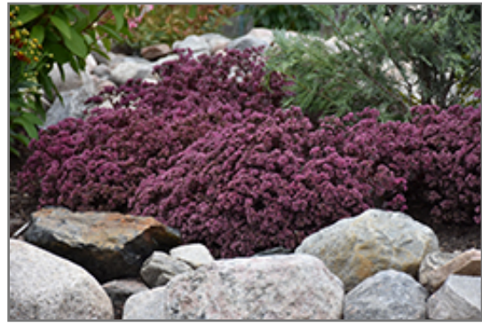
Cherry Tart Stonecrop in bloom

Cherry Tart Stonecrop is a dense herbaceous perennial with an upright spreading habit of growth. Its medium texture blends into the garden, but can always be balanced by a couple of finer or coarser plants for an effective composition.