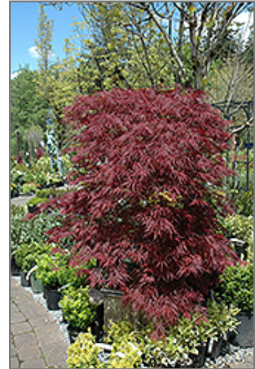
Red Dragon Japanese Maple

Red Dragon Japanese Maple is a fine choice for the yard, but it is also a good selection for planting in outdoor pots and containers. Because of its height, it is often used as a 'thriller' in the 'spiller-thriller-filler' container combination; plant it near the center of the pot, surrounded by smaller plants and those that spill over the edges. It is even sizeable enough that it can be grown alone in a suitable container. Note that when grown in a container, it may not perform exactly as indicated on the tag - this is to be expected. Also note that when growing plants in outdoor containers and baskets, they may require more frequent waterings than they would in the yard or garden.