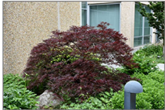
Red Dragon Japanese Maple

This is a relatively low maintenance tree, and should only be pruned in summer after the leaves have fully developed, as it may 'bleed' sap if pruned in late winter or early spring. It has no significant negative characteristics.