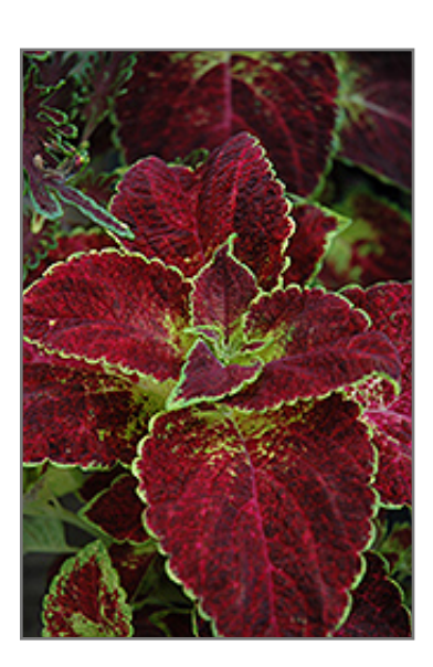
ColorBlaze Dipt in Wine Coleus foliage