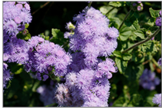
Blue Horizon Flossflower flowers

Blue Horizon Flossflower is recommended for the following landscape applications;