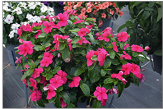
Titan Punch Vinca in bloom

Titan Punch Vinca will grow to be about 14 inches tall at maturity, with a spread of 12 inches. Its foliage tends to remain dense right to the ground, not requiring facer plants in front. Although it's not a true annual, this fast-growing plant can be expected to behave as an annual in our climate if left outdoors over the winter, usually needing replacement the following year. As such, gardeners should take into consideration that it will perform differently than it would in its native habitat.