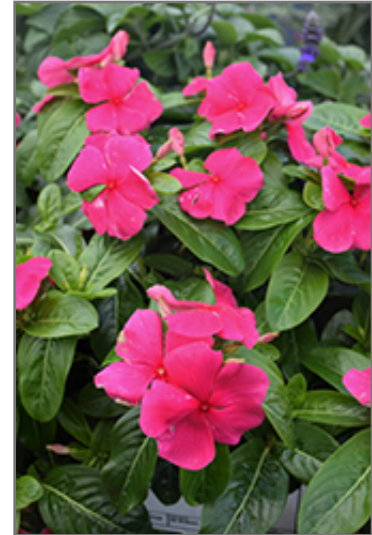
Titan Punch Vinca flowers

Titan Punch Vinca is recommended for the following landscape applications;