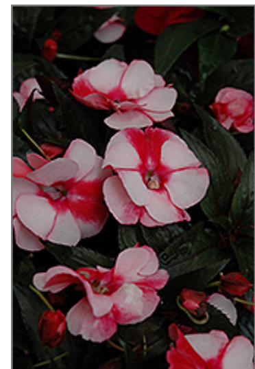
Sonic Sweet Cherry New Guinea Impatiens flowers