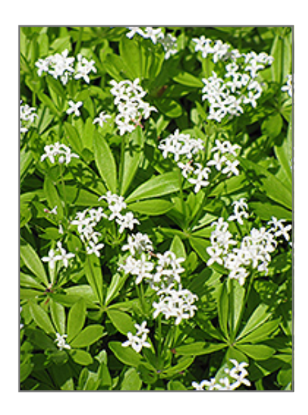
Sweet Woodruff flowers

BRUNSWICK 422 Bath Road Brunswick, ME 04011 1-800-339-8111 207-442-8111