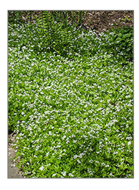
Sweet Woodruff in bloom