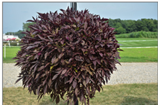
Illusion Garnet Lace Sweet Potato Vine

BRUNSWICK 422 Bath Road Brunswick, ME 04011 1-800-339-8111 207-442-8111