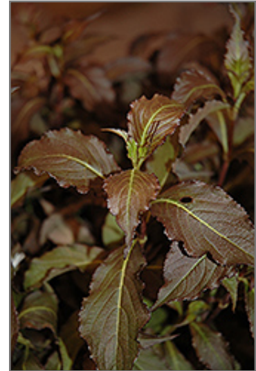
Spilled Wine Weigela foliage

Spilled Wine Weigela makes a fine choice for the outdoor landscape, but it is also well-suited for use in outdoor pots and containers. Because of its height, it is often used as a 'thriller' in the 'spiller-thriller-filler' container combination; plant it near the center of the pot, surrounded by smaller plants and those that spill over the edges. It is even sizeable enough that it can be grown alone in a suitable container. Note that when grown in a container, it may not perform exactly as indicated on the tag - this is to be expected. Also note that when growing plants in outdoor containers and baskets, they may require more frequent waterings than they would in the yard or garden.