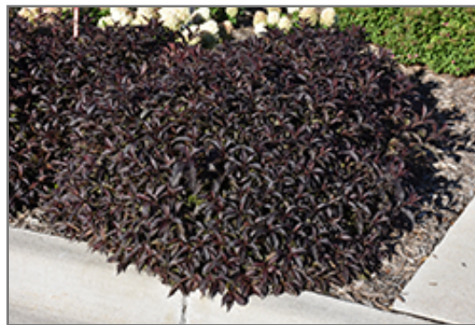
Spilled Wine Weigela