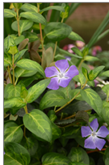
Maculata Periwinkle flowers

Maculata Periwinkle is recommended for the following landscape applications;