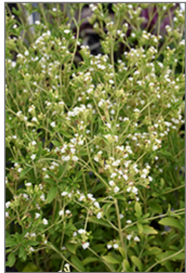
Sweetleaf flowers

BRUNSWICK 422 Bath Road Brunswick, ME 04011 1-800-339-8111 207-442-8111